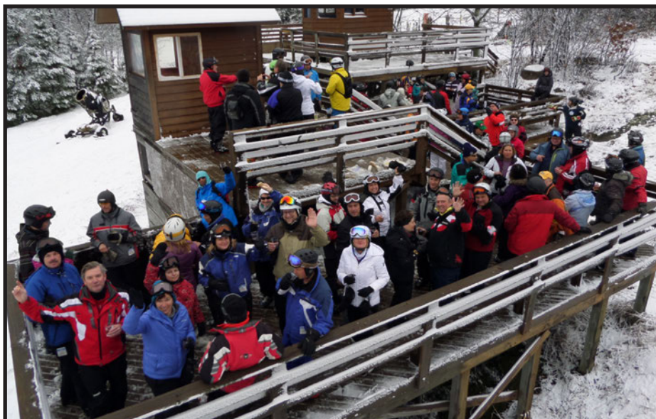
Some of the MSC Winter Carnival bunch at the Wine & Cheese party on the hill.