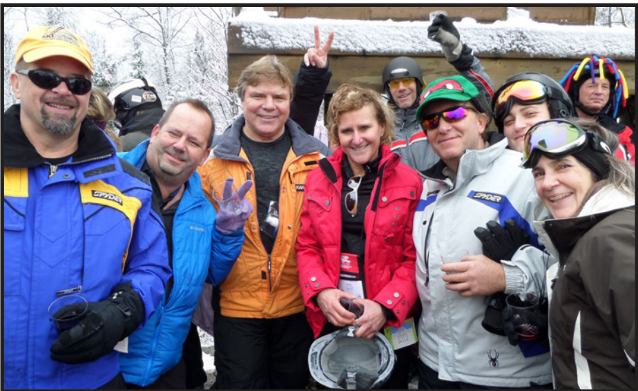
Some Sitzmarkers at the MSC Winter Carnival.