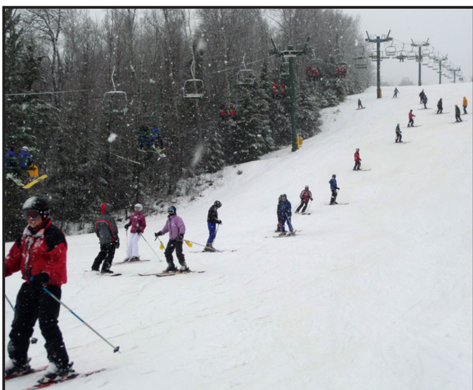
MSC Winter Carnival human slalom in progress.

seth.dostal@state.mn.us 800-688-7669, ext. 8008