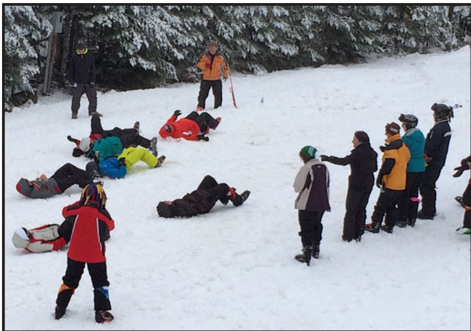
Men's Turtle Races at the MSC Winter Carnival.