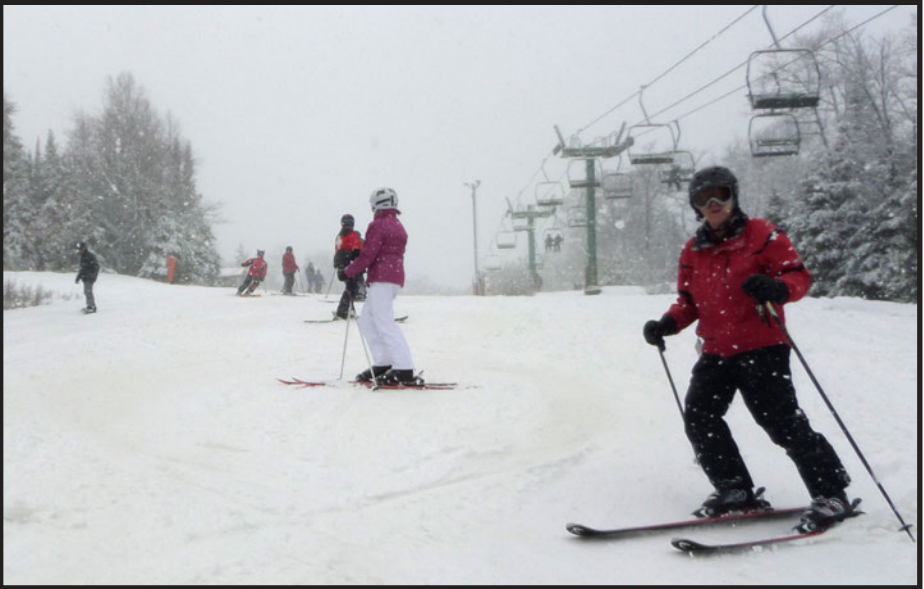
Part of the human slalom at the MSC Winter Carnival.