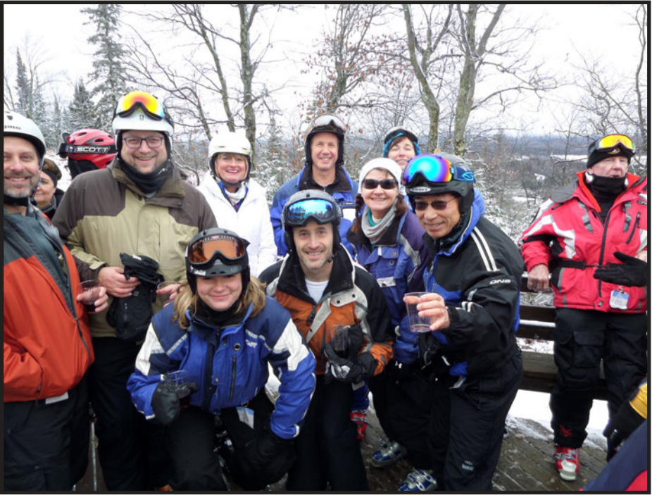
Part of the 3M gang at the MSC Winter Carnival.