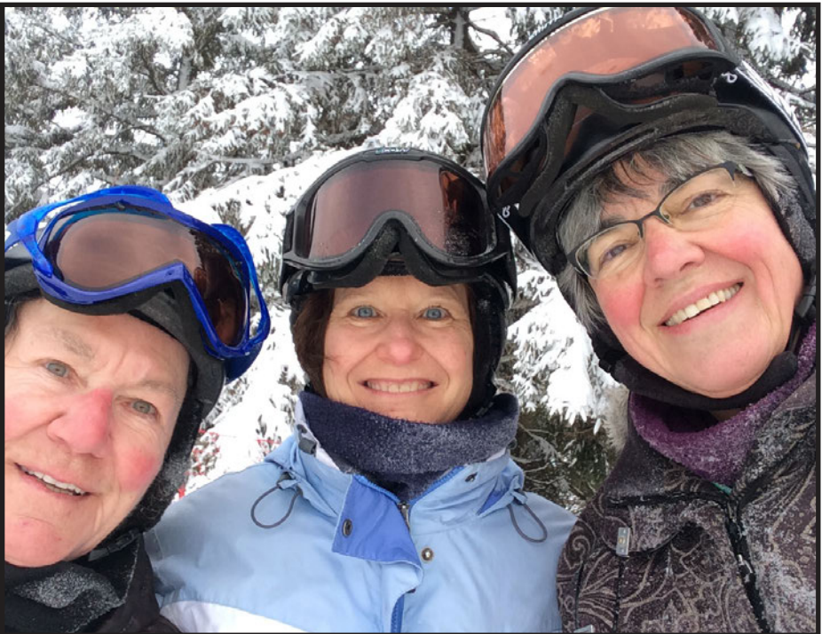
Some Tuesday Wipeouts enjoying the sun and snow at Afton Alps.